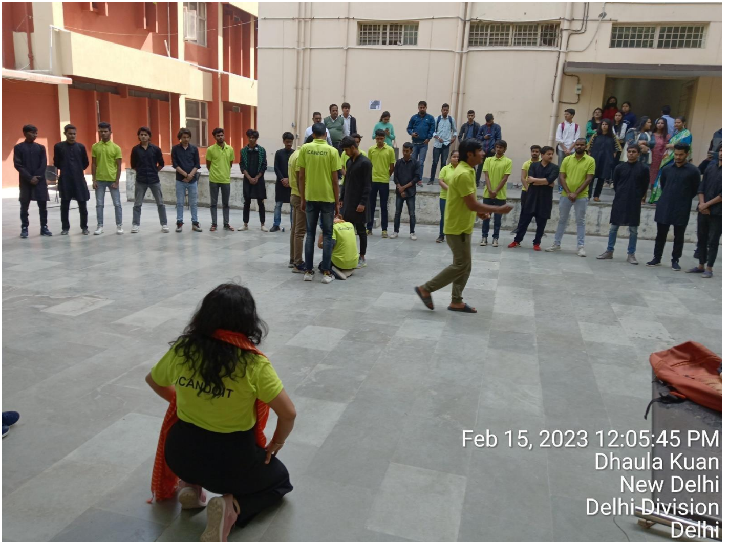
ICANDOIT Theatre Group performing in the canteen area of Sri Venkateswara College